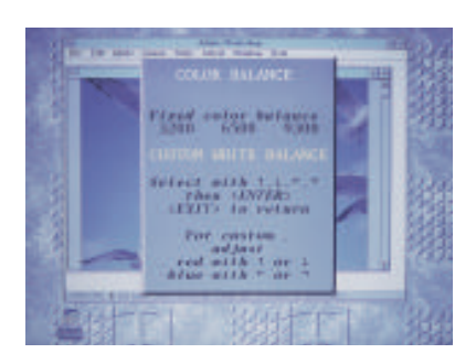
Logical menus and intuitive on-screen displays greatly simplify control and setup of the Barcographics 2100.